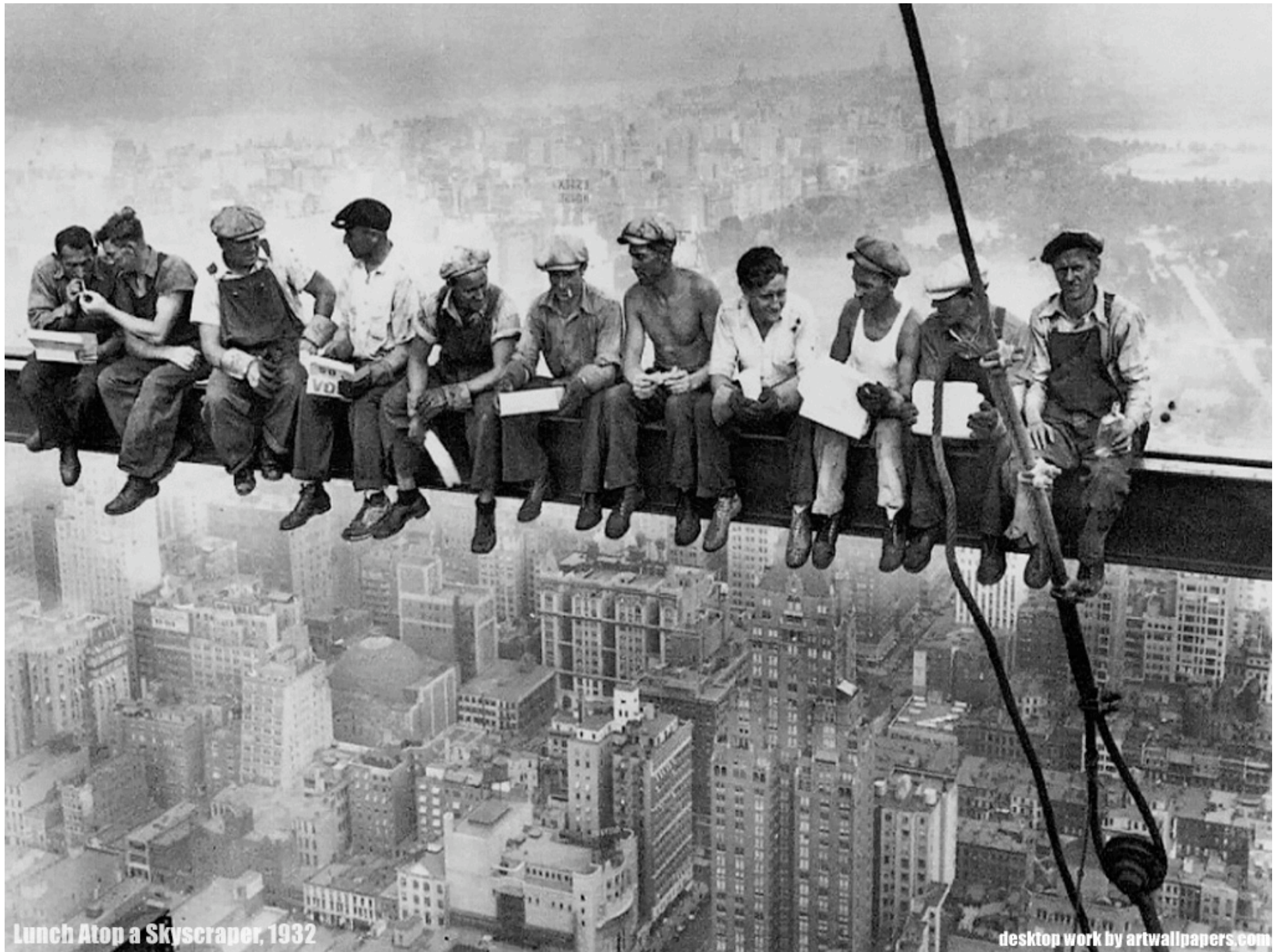
Lunch Atop a Skyscraper, 1932